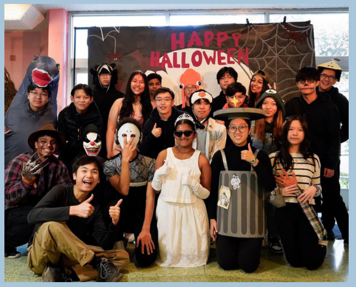
Costume Contest with student council!