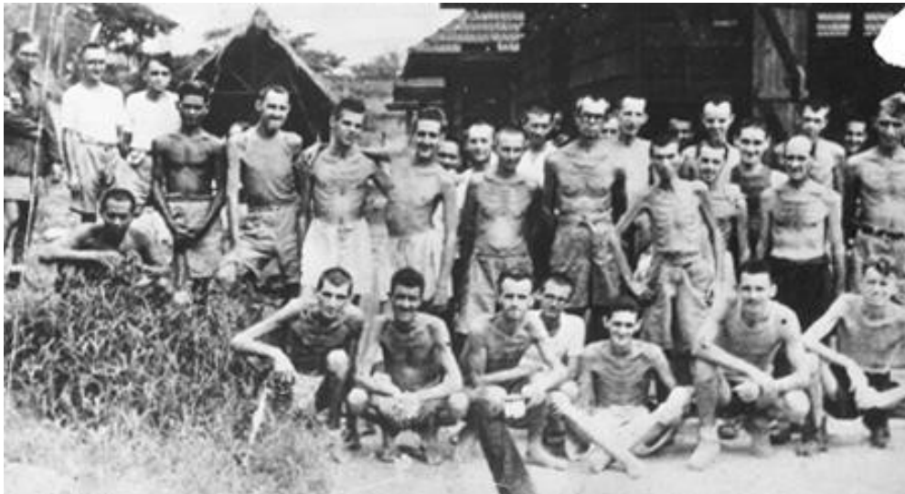
Figure 8: Canadian prisoners in a Japanese POW camp

MacDonell explains the difference between what they needed and what they had to eat: