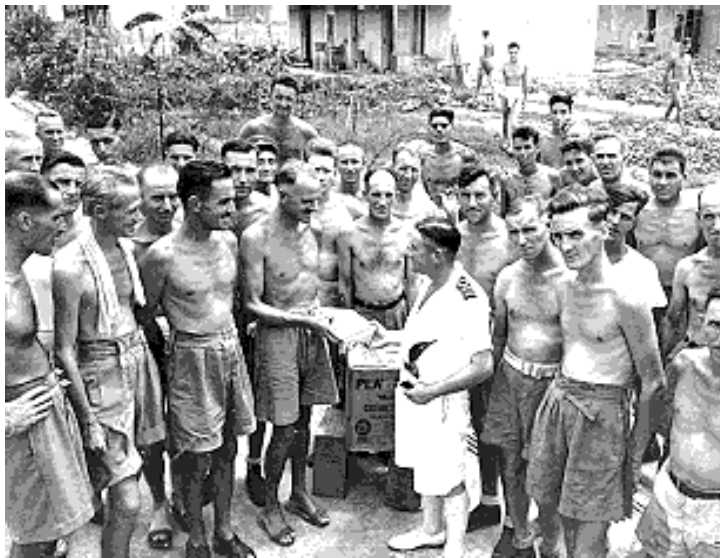
Figure 12: Canadian prisoners liberated from a Hong Kong POW camp

The surviving prisoners were liberated after the fall of Japan. Many were too weak to walk, and it was months until they were healthy again.