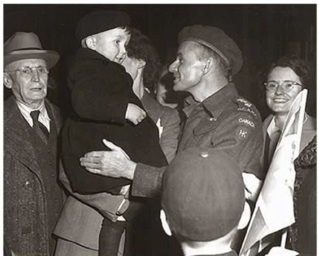
Figure 13: POW survivor Captain Stanley M Banfill returns home (Jacques 1945)