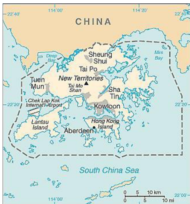
Figure 2: Map of Hong Kong Island 1941 (HKVCA website)

Strategically, the British were not well prepared to defend Hong Kong.