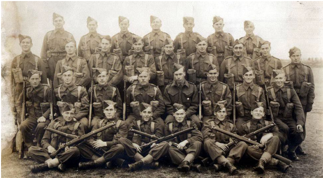
Figure 1: Non-Commissioned Officers of the Royal Rifles taken at Sussex NB

Canada's first major combat experience of the Second World War was in the Pacific region. They did not confront Hitler's armies, but rather the expansionist Empire of Japan. In December 1941, the Canadian government honoured a British request to bolster the defences of Hong Kong. Canada sent 1,975 troops, consisting of two battalions of infantry and a brigade headquarters. Our forces included the Royal Rifles of Canada and the Winnipeg Grenadiers. The battle for Hong Kong, a British Crown Colony, would turn out to be a debacle.