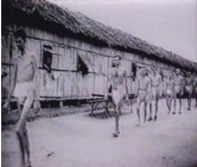
Figure 7: Emaciated POWs 1943

Hunger was a constant. Food was often the main topic of conversation as men tried to remember specific meals of the past, favourite restaurants, and recipes. This obsession with food reflected the lack of it in the camps. Most of the time, the food in POW camps was insufficient and nothing more than filthy rice.