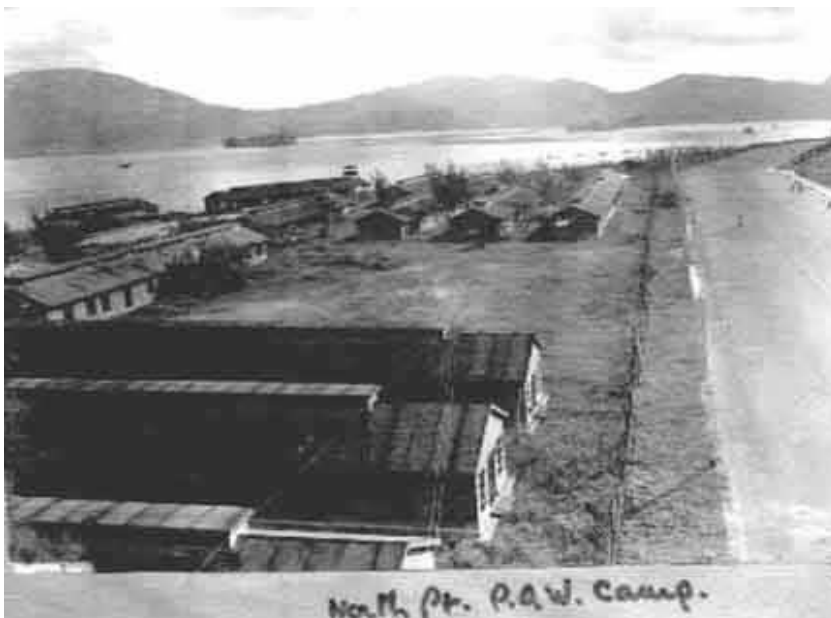
Figure 6: North point Prisoner-of-War camp buildings

The flies swarm through every man's recollections. One veteran had the smothering nauseating sensation of almost breathing flies. They settled on every forkful of food before it could reach the mouth. Men spent their days swatting flies....The bedbugs were especially hated. Attempts to eliminate the vermin were completely unsuccessful. Captain Banfill noted on release in 1945 that 'the bedbugs were so tough that when I put a couple in a bag of DDT, it didn't even faze them!' (60)