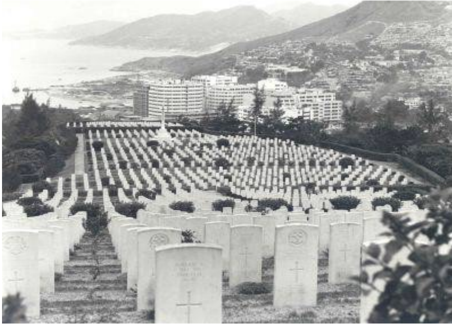
Figure 10: Sai Wan Bay War Cemetery, Hong Kong