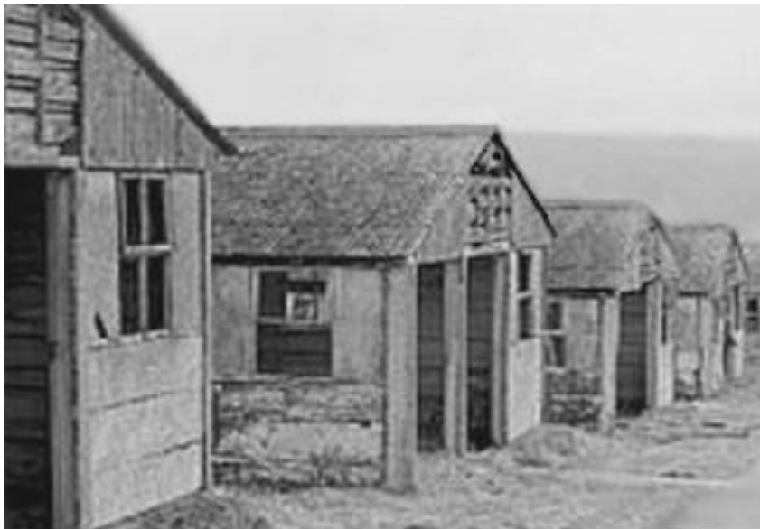
Figure 4: Prisoner barracks, North Point Camp in Hong Kong

Accommodation was no better, as at first we had all the British and Indian troops as well as the Canadians. We were packed about 200 men into a hut designed to hold perhaps 30 refugees. There was no glass in the windows and in some huts large holes in the roof. Most of us had no blankets and the concrete floor was no Beauty Rest Mattress. Hong Kong can be damp and surprisingly cold at that time of the year. (Palmer 34-35)