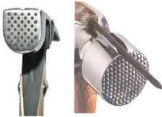
Waffle Milled from: www.hammersource.com

Safety Facts: do not strike a hammer with another hammer.