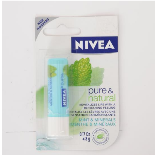
Nivea Mint & Minerals Lip Balm