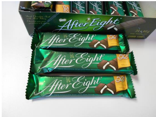
After Eight Mint Chocolate Bar