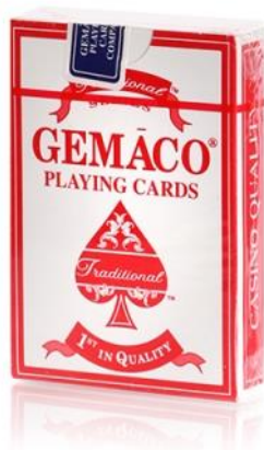
Deck of Cards (Gemaco)