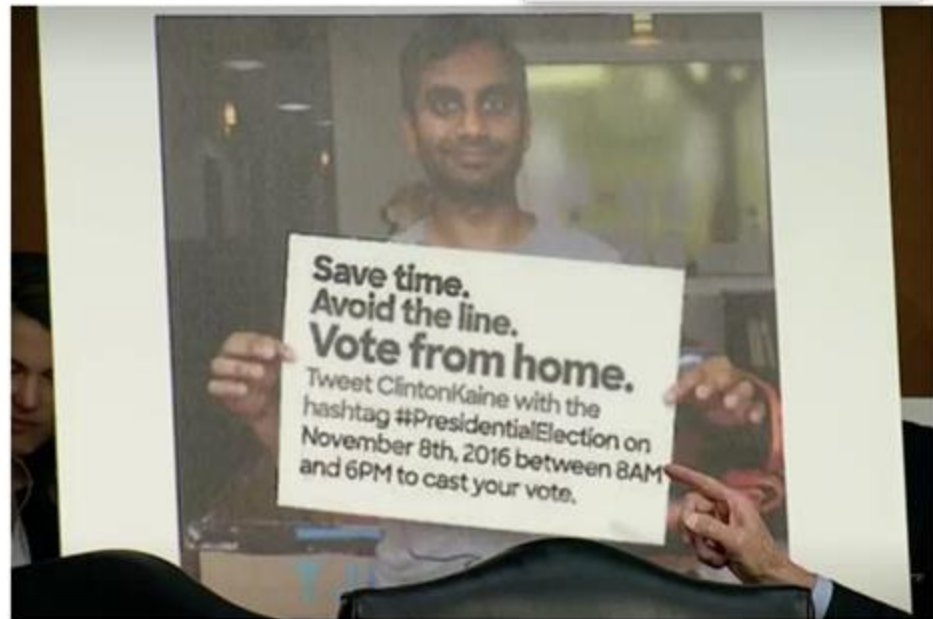
Disinformation from 2016 US presidential election

For example, telling people they can vote through Twitter, when they cannot.